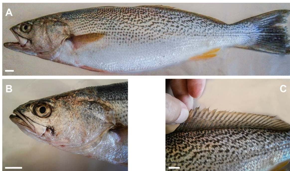
Figure 2. The specimen of weakfish Cynoscion regalis collected in the Guadiana estuary on 16 June 2016 (A), and detailed photos of the head and operculum (B) and of the pigmentation pattern in the dorsal area and second dorsal fin (C). Scale bars: 1 cm.