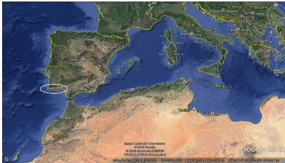
Figure 1. An image of the relative location of the Algarve in southern Portugal and the Mediterranean Sea [1]

In fact, Northern Bluefin tuna ( Thunnus thynnus LINNAEUS 1758) passes in a migratory cycle from the Atlantic Ocean to the warmer waters of the Mediterranean Sea to spawn, called atum de direito and later, after spawning, in the reverse direction, called atum de revés .