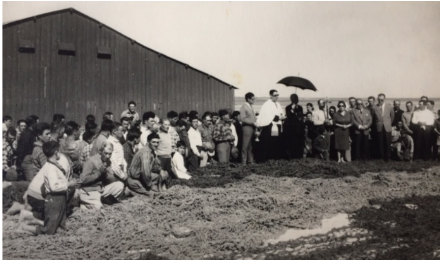
Figure 6. The warehouse

lived separately in isolated and large spaces and their houses were in front of the working area where the nets, cables, floating buoys and iron anchors were handled, between the sheds and the warehouse, which was the ideal location to control all the works in the Arraial (Figure 6).