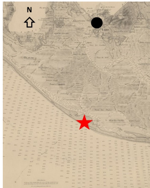
Figure 2. “Hydrographic Plan of the bars and ports of Faro and Olhão of 1885”, highlighting the city of Faro (black circle) and the location of the Arraial (red star) [3]

This research was based on documentary analysis, photographic and bibliographic research but, also in interviews with people involved in the tuna fishing, that still remains. During the development of this research, limitations were found due to the scarcity of available information and to the advanced age of the people involved, now with around 90 years old. That is why there is an urgency to make an adequate registration and disclosure of this - vernacular architectural and engineering heritage.