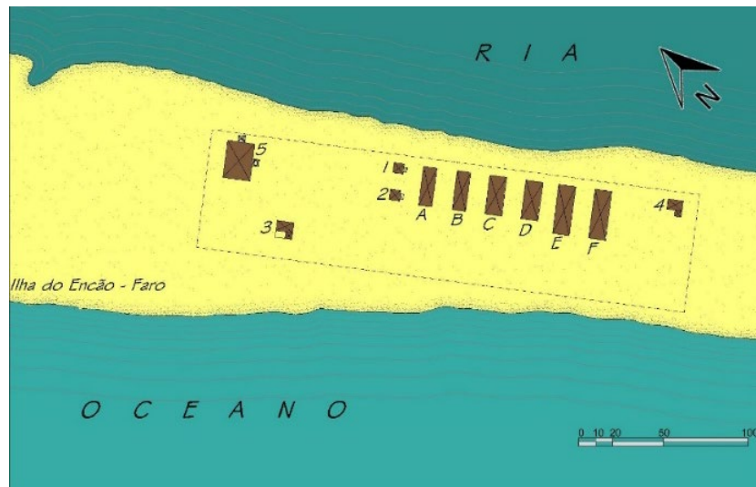
Figure 4. A scheme of the implantation of the Arraial in 1936: 1 - House of the Mandador ; 2 - House of the Escrivão ; 3 - House of the Directors; 4 - Bar and small market; 5 - Warehouse; A, B, C, D, E, F – Sheds of Companheiros . Between 1,2,3 and 5 – working area

These constructions were divided lengthwise into twenty to twenty-four compartments ordered numerically, from the East to the West. Each compartment possessed a single outside shuttered door just like the old reed houses (Figure 5).