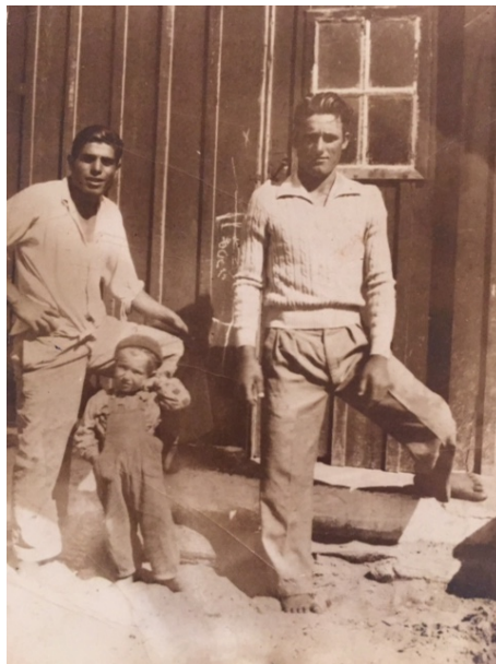
Figure 5. Two Companheiros and a child in front of one of the sheds' shuttered doors

These constructions were divided lengthwise into twenty to twenty-four compartments ordered numerically, from the East to the West. Each compartment possessed a single outside shuttered door just like the old reed houses (Figure 5).