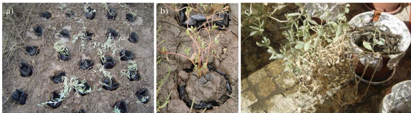
Fig. 1 Pictures from the H. portulacoides study. a Litterbags planting area in Comporta ; b a detail of a litterbag; c a vase of the laboratorial study

All the samples were collected to a polyethylene plastic bag and immediately stored in a portable refrigerator. Until analysis, samples were kept frozen at -20^{\circ}\text{C} . Before analysis, sediments were sieved through a 2-mm mesh with