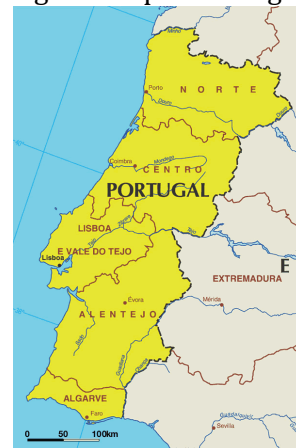
Fig. 1 – Map of Portugal

The Algarve is bordered in the north by the Alentejo region, south and west by the Atlantic Ocean and east by the Guadiana River which marks the border with Spain - see Fig. 1.