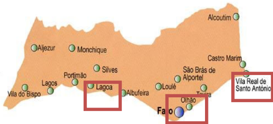
Fig. 3 – Coastal areas of Algarve implementing rehabilitation policies

Real de Santo António are integrated into a laguna system called Ria Formosa.