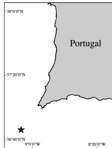
Figure 1. - Map of the southwest coast of Portugal with location of the capture (★) of the Deania profundorum specimen. [Carte de la côte sud-ouest du Portugal, indiquant le lieu de capture (★) du spécimen de Deania profundorum .]

The specimen was taken to the University of the Algarve laboratory (FCMA/DP/01/2004), where most of the measurements