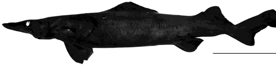
Figure 2. - Photograph of the Deania profundorum specimen captured along the Portuguese south coast. Scale bar = 20 cm. [Photographie du spécimen de Deania profundorum capturé dans le sud du Portugal. Barre d'échelle = 20 cm.]