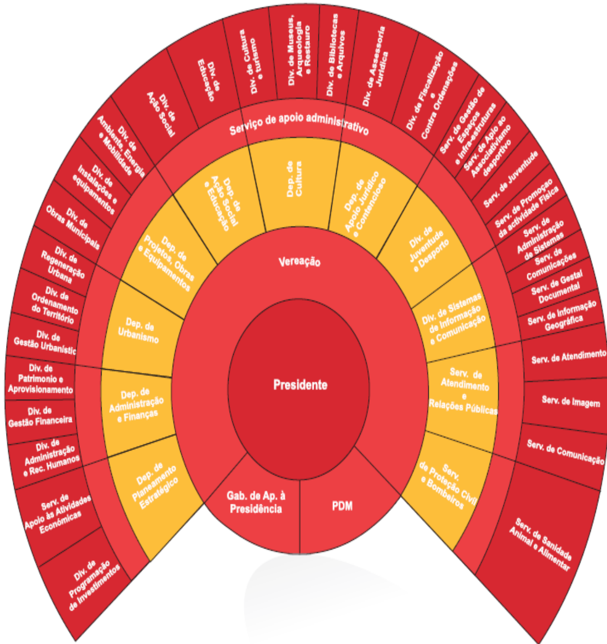
Figure 1.3 – The organogram of Faro’s Municipal Town-Hall