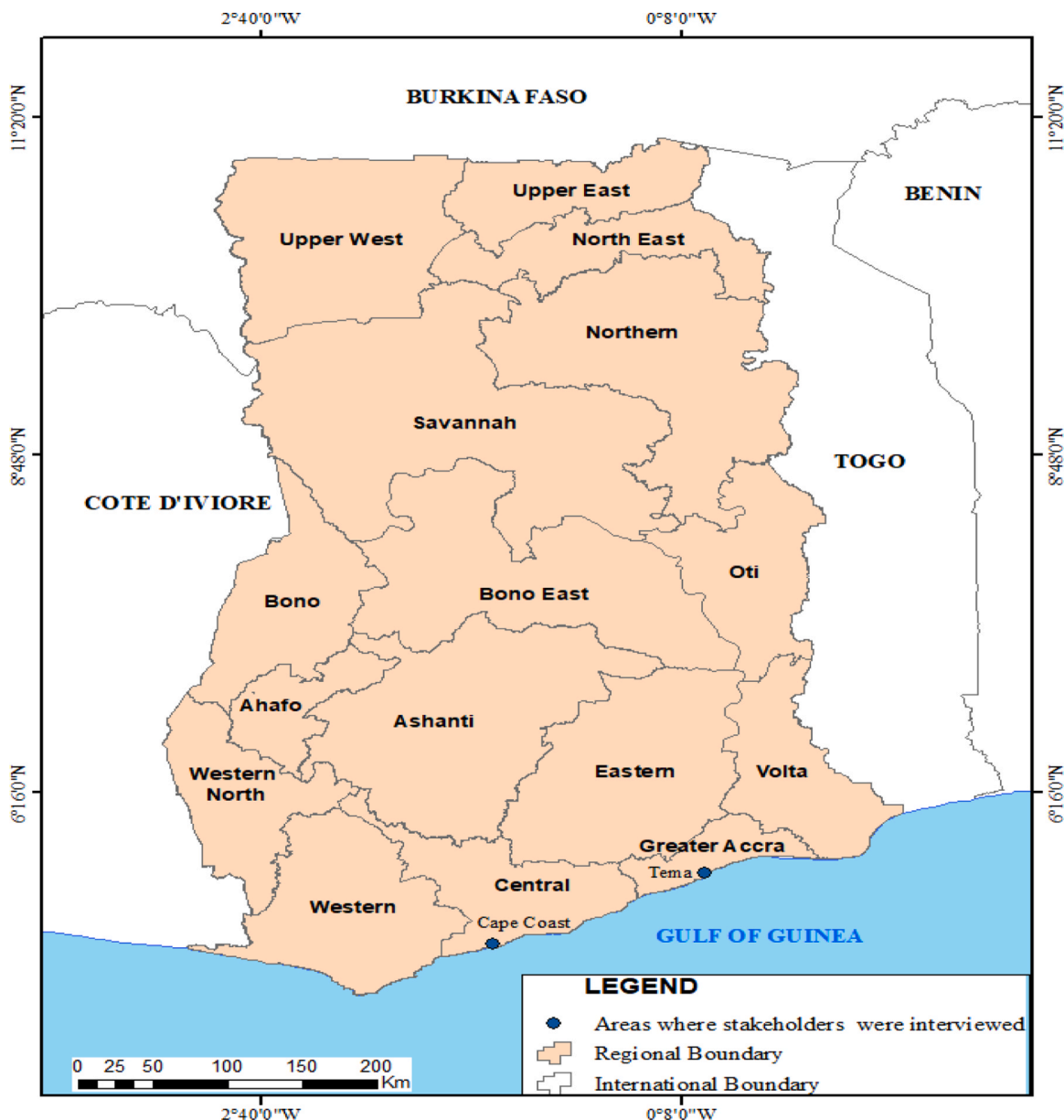
Fig. 3. The coastal and marine zone of Ghana, including the two sites (i.e., Cape Coast and Tema), where questionnaires were administered to fisheries managers, fishers, residents, and non-residents.

Ghana (see Fig. 3), a sub-Saharan West African coastal country bordered on the north by Burkina Faso, to the south by the Gulf of Guinea (Atlantic Ocean), to the east by Togo, and on the west by Cote d'Ivoire, was selected for the study due to its ratification of the several conventions for the management of coastal and marine resources (i.e., fisheries, beachfront, dunes, rocky beaches, and biodiversity) [29,103, 121]. Additionally, marine fishing and activities around beaches (e.g., tourism, and sand and stone mining) are essential economic ventures in Ghana [66,118]. The country has a coastline of 550 km (i.e., with over 70 % being sandy), a lower middle-income status, practices presidential democracy with strong institutions (i.e., the Parliament of Ghana, judiciary and civil societies) and ranked tops in several governance surveys across Africa [3,5,112,118]. Tema (i.e., in Greater Accra) and Cape Coast (i.e., Central) are essential coastal fishing communities, with