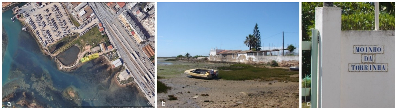
Fig. 6. Torrinhã's mill. a) location (in yellow); b) view of the old mill; c) identification of private property with the name "Torrinhã's Mill" (author)

The owners named this property "Moinho da Torrinhã" (Torrinhã's mill) as a way to mark the past of these buildings and the place where the mill was located.