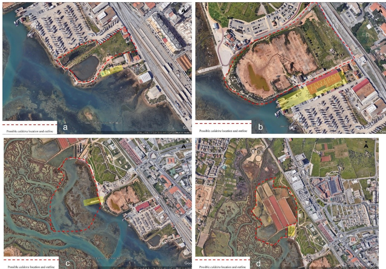
Fig. 5. Possible caldeiras location and outline. The yellow shows the possible location of the mills. a) Torrinhã's mill; b) Sobradinho's mill; c) Grelha's and Gordinho's mills; d) Penteados's mill (author)