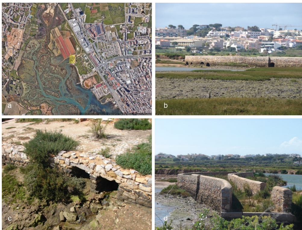
Fig. 9. Penteado's mill. a) location (in yellow); b) general view of the ruins; c) detail of the lower passages; d) detail (author)

that it had several grinding rooms, which does not seem very plausible given the dimensions of the existing mills in Faro, or the fact that one set is actually from the mill (in arch) and the other set is only to give way to the numerous streams that exist on site, and therefore being just a way of crossing a water line. This last hypothesis seems to us the most acceptable.