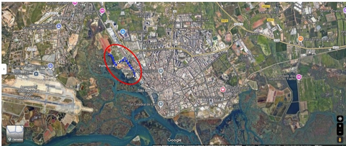
Fig. 3. City of Faro and the location of the proposed pedestrian path (author)

The proposed route is developed in the western part of Faro (Figure 3). There is currently a small concentration of old tide mills, having been found only four sites where they existed, as can be seen in Figure 4. These mills were: 1) Torrinha's mill; 2) Sobradinho's mill; 3) Greilha's and Gordinho's mills; 4) Penteados's mill. All the maps were elaborated by the author and based on Google Maps or Google Earth.