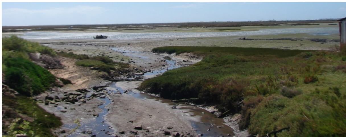
Fig. 10. Lagoon landscape of the Ria Formosa

The tide mills do not only exist in Faro; along the entire coast of the Algarve, they exist or existed and should be the subject of an in-depth study on the subject, and can be offered as drivers of tourism and, in a final goal, to create the opportunity for reconstruction and preservation of these vernacular heritage elements.