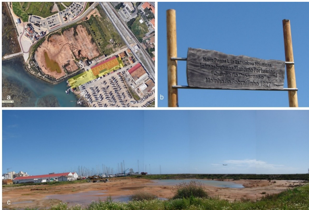
Fig. 7. Sobradinho's mill. a) location (in yellow); b) information board on the site; c) panoramic of the old caldeira mill and the current pavilions where it is believed that would have been the old mill