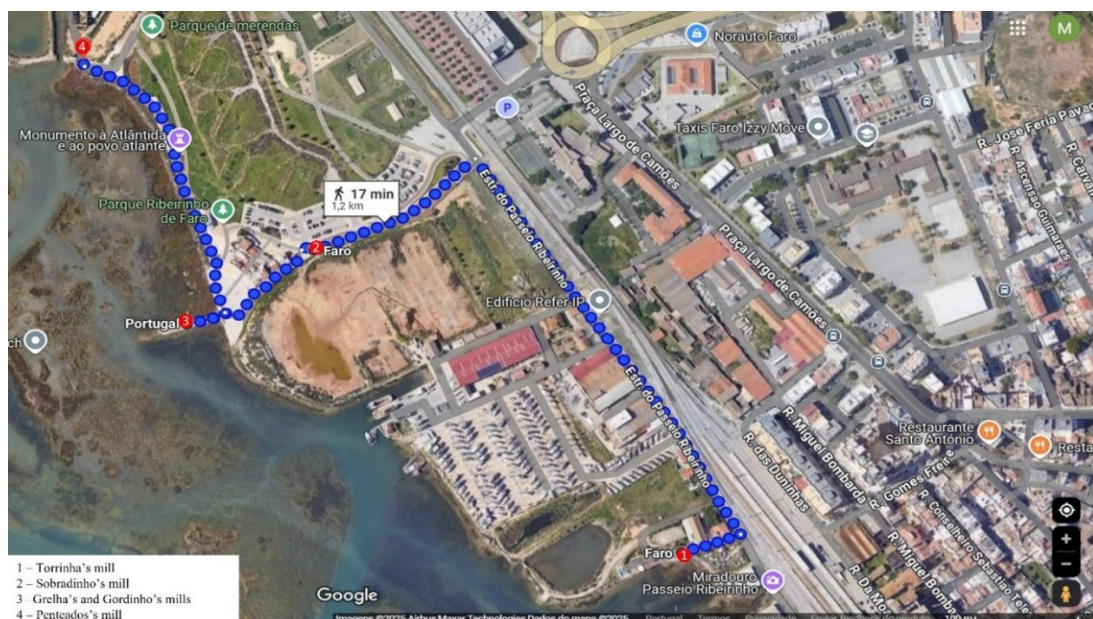
Fig. 4 Proposed pedestrian path under the theme of vernacular heritage and tourism, to the city of Faro (author)

Two of the mills found were in ruins, but preserved, because they are inserted in the Riverside Park of Faro, one of them was transformed into private housing and the other only its old caldeira can be seen its, because it is thought that the buildings of the mill gave place to other more recent buildings that were built over the foundations of the same. However, using Google Earth, we can identify approximately each of the caldeiras (Figure 5).