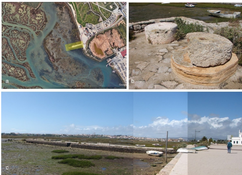
Fig. 8. Grelha's and Gordinho's mills. a) location (in yellow); b) old grindstones; c) panoramic of the ruins of the old mill of Grelha, inserted in the leisure area of the Faro Riverside Park

You can still see the base of the walls of the mill and some millstones that were placed there as a way to give identity to the place. There are also the lower openings through which the water passed from the caldeira to the Ria, making the grindstones work (Figure 8).