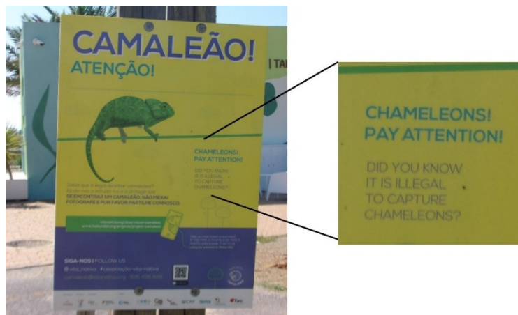
Fig. 1. Board to warn of the existence of chameleons and to warn to be careful, not to capture them or cause them damage (author)

The Ria Formosa constitutes the Natural Park of the Ria Formosa and is located between the sea and the land, being the most important wetland in the south of Portugal. It is separated from the sea by a chain of barrier islands, being fed with fresh water by small watercourses with seasonal regime [8]. In this Park there are several habitats, from dunes, marshes, pine areas, agricultural areas, among others and is an important area in terms of birds, for example ( ib. ), having a high ecological (Figure 1), scientific, economic and social value. It is therefore not surprising that it was declared a Natural Reserve in 1979, renamed as a Natural Park in 1987, is covered by the provisions of the Ramsar and Bern Conventions, and has been considered by the Wetlands Directory of the IUCN (International Union for the Conservation of Nature) as "a wetland of world interest, belonging to the Park itself to the list of Corine Biotopes. The Parc is also part of the Natura 2000 Network, being considered in the European context as an Important Bird Area (IBA) [9].