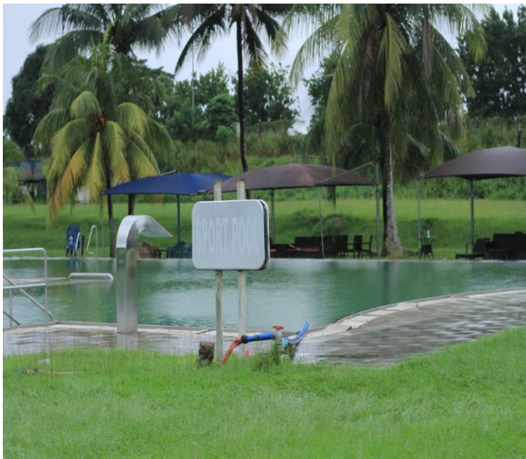
Fig. 3.11: Tinapa sport pool