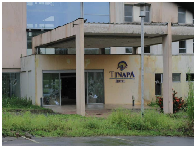
Fig. 3.9: Tinapa Accommodation

Some images of this resort can be observed in Figures 3.9 to 3.13.