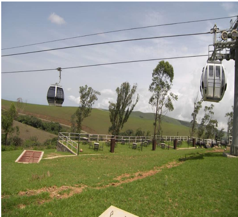
Fig. 3.5 Obudu Mountain Resort Cable vehicle