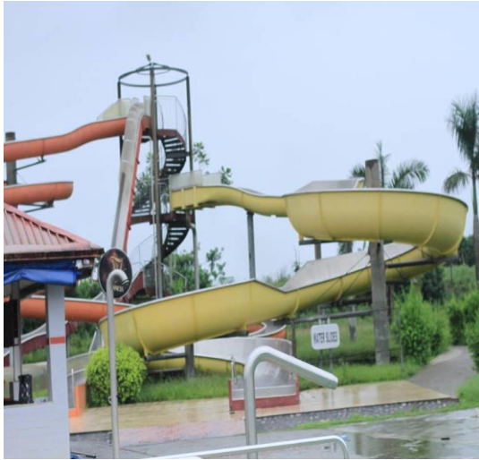
Fig. 3.10: Tinapa Water Slider