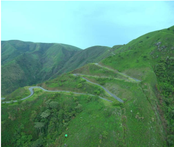
Fig. 3.4: Obudu Mountain Resort Trail