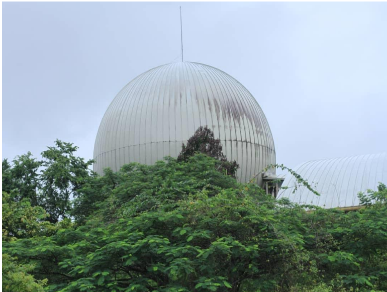
Fig. 3.13: Tinapa Conference Hall