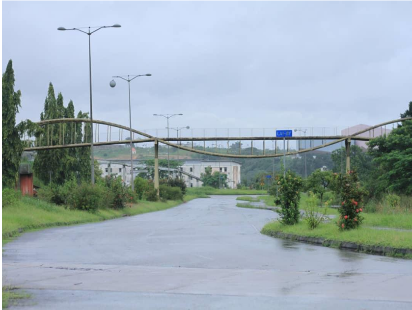
Fig. 3.12: Tinapa zig-zag Footbridge