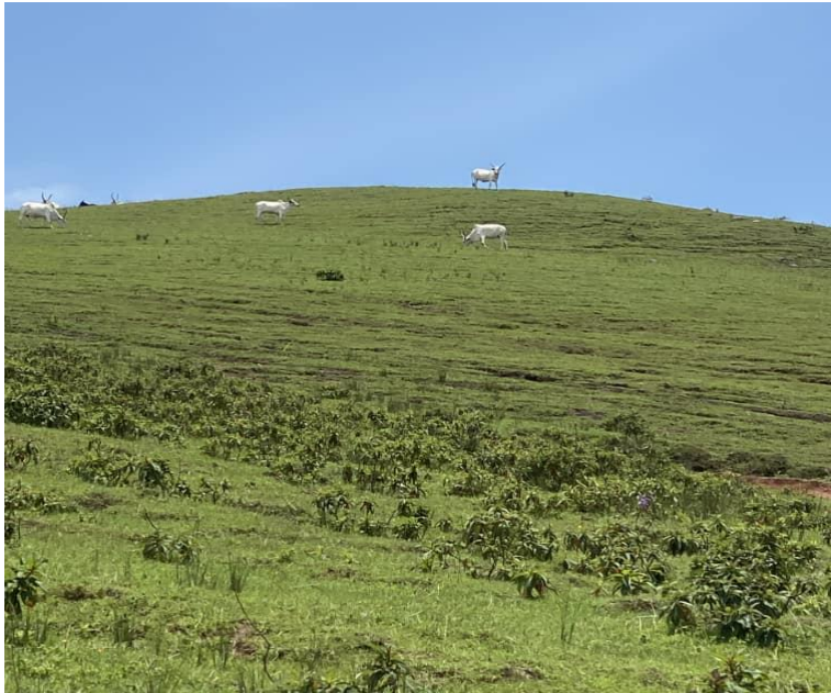
Fig. 3.6 Obudu Mountain Resort Cattle Hill