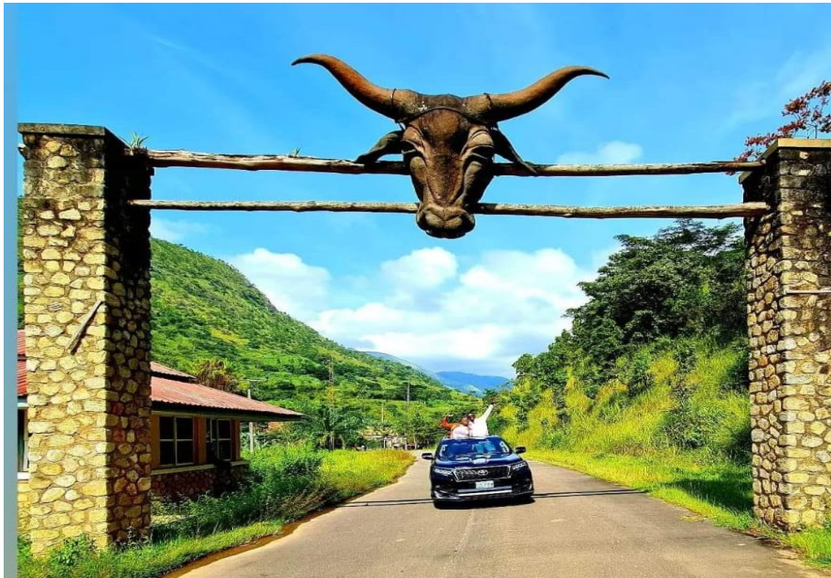
Fig. 3.1: Obudu Mountain Resort Entrance Gate

Some images of this resort can be observed in Figures 3.1 to 3.8.