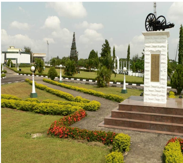
Fig. 3.7 Obudu Mountain Resort Open Air Park