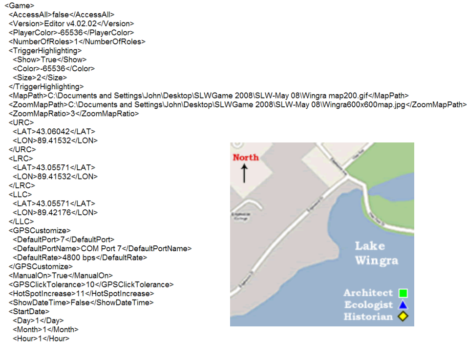
Figure 3. Screen Layout and XML script of AR game developed at ADL Co-Lab