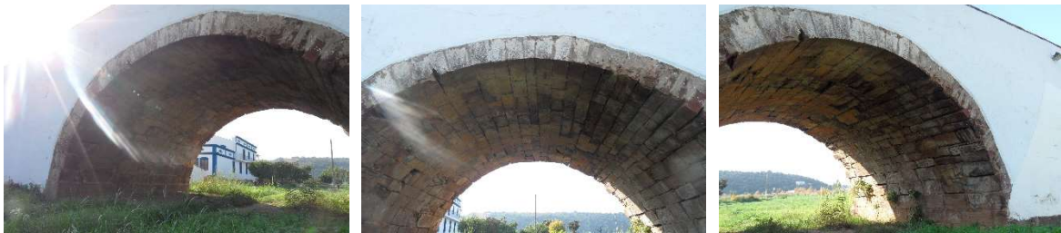
Figure 3: Digital images with the lens optical axis slightly upwards towards the arch inner face.

The arches were covered with left to right, frontal and right to left directed lens optical axis relative to the arch and slightly upwards towards the arch inner face (figure 3). Images were acquired from both sides of the arch. The camera was distanced to the floor about 0.5 meters.