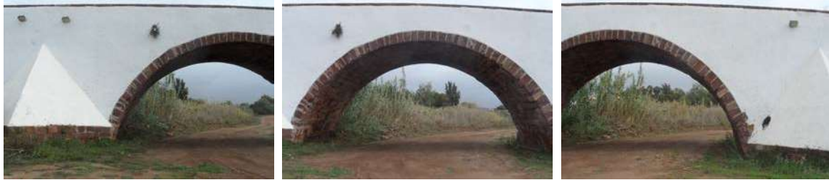
Figure 2: Digital images with the lens optical axis perpendicular to the bridge faces.

The bridge faces were covered with the lens optical axis perpendicular to the faces also maintaining the distance to it (figure 2). The camera was distanced to the floor about 1.5 meters.