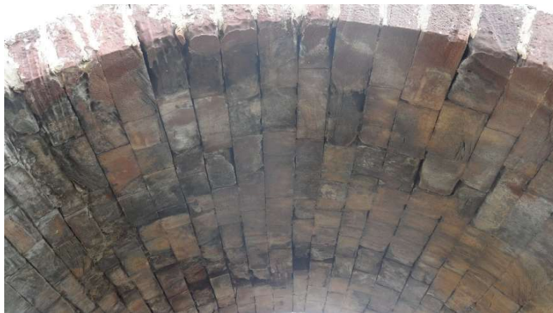
Figure 7: Arch zoom-in for materials identification and degradation status.

Because photographic images were made, also the materials identification and degradation status (figure 7) was registered, adding information and being the basis of the 4 dimensions model of the old bridge in Silves, assessing the bridge materials evolution.