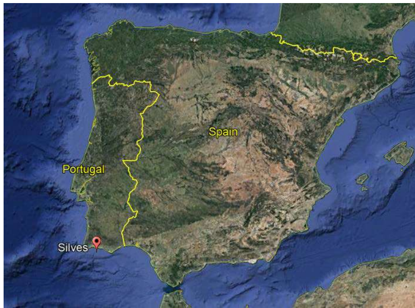
Figure 1: Location of Silves, southwest of Iberic Peninsula.

The old bridge in Silves is aligned nearly north-south with the river running from east to west. However, due to the riverbed's small height above sea-level of about 2 m and not too far from the shoreline of about 15 km, the water level of the Arade river is influenced by tides, allowing small boats to navigate upstream to Silves, an important feature to Silves during its period as the Moorish capital, between the 8th and 13th centuries occupation of the Algarve.