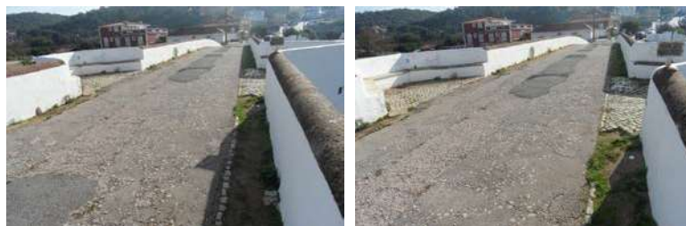
Figure 4: Digital images with the lens optical axis in about 45 degrees with the crossing road.

Finally, the crossing road was covered with the lens optical axis in about 45 degrees with the road and from the left side slightly to the right and vice-versa (figure 4), in 4 lines combining the roadside, left or right, with walking north towards or south away from Silves town. The camera was distanced to the floor about 2.0 meters. Particularly the crossing road could have been covered with the help of an UAV.