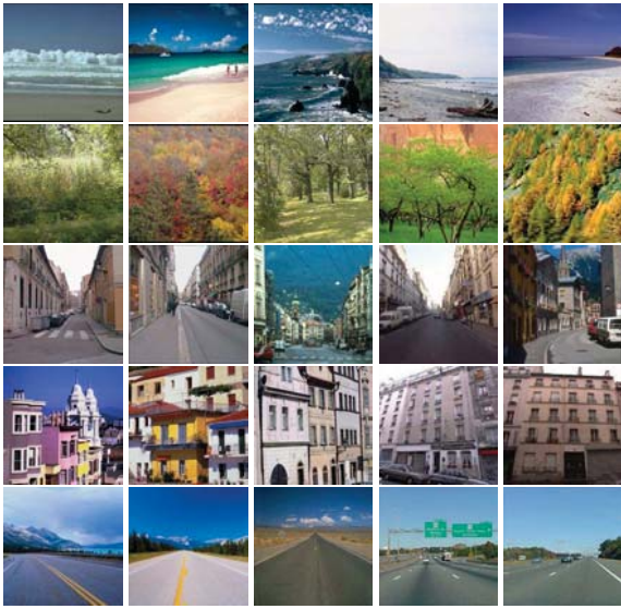
Figure 2: Examples of images of, top to bottom, coast, forest, street, inside city and highways. The left column shows images of the training set.

and du Buf, 2006). In the spatial domain (x,y) they consist of a real cosine and an imaginary sine, both with a Gaussian envelope. The receptive fields (filters) can be scaled and rotated. We apply 8 orientations \theta and the scale of analysis s will be given by the wavelength \lambda , expressed in pixels, where \lambda = 1 corresponds to 1 pixel. All images have 256 \times 256 pixels.