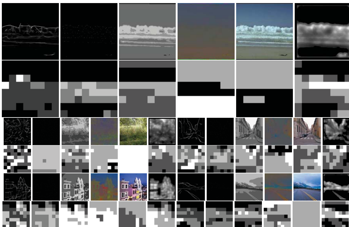
Figure 3: The odd rows show features in layer 1 of the images in the left column of Fig. 2. The even rows illustrate responses of gating cells in layer 2, where the 8 \times 8 array is represented by the squares. Gray level, from black to white, indicate response levels A to D. See text for details.

gion, and the four intervals of the densities KP_d of the gating cells are [0, 0.01] , ]0.01, 0.1] , ]0.1, 0.5] and ]0.5, 1.0] . These values were determined empirically after several tests using the training set.