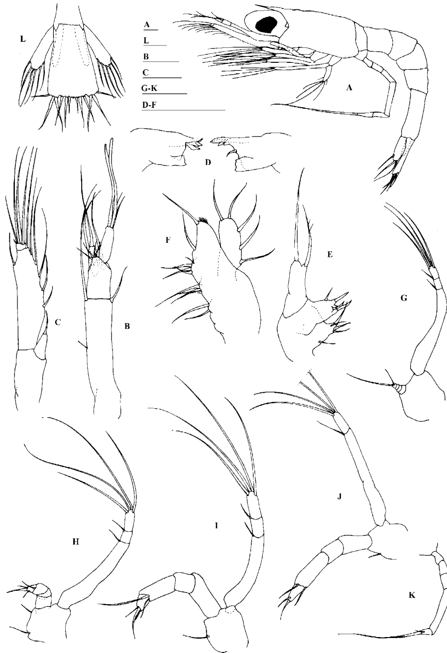
Fig. 2. Second zoeal stage of Athanas nitescens (Leach, 1814). A , lateral view; B , antennule; C , antenna; D , mandibles; E , maxillule; F , maxilla; G , first maxilliped; H , second maxilliped; I , third maxilliped; J , first pereiopod; K , fifth pereiopod; L , telson and uropods. Scale bars: A-L , 100 \mu m.

Fifth pereiopod (Fig. 2K): Five segmented, with the last segment shaped as a long and slender stylet, displaying a serrated extremity (as figured).