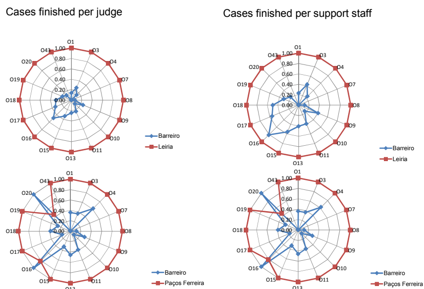
Figure 1 – Comparing the efficiency of Barreiro's court with the efficiency of its peers

Table 3 also shows those courts with the most robust performances and which can represent important platforms for learning, namely: Leiria, Cadaval, Matosinhos, Amares, Arouca, Cascais, Paços de Ferreira, Lousada, Cinfães and Figueira Castelo Rodrigo. Each of these 10 courts was considered efficient in at least three of the five years assessed and obtained an average efficiency score above 92%. The only courts that were considered technically efficient in the five consecutive years were the ones in Leiria and Matosinhos. It is also worth noting that the number of courts for which Leiria is a benchmark has increased considerably over the years. For instance, 8.0% of the inefficient courts identified Leiria as a peer in 2007, 18.9% in 2009 and 62.7% in 2011. A post-evaluation study aimed at analysing the processes and