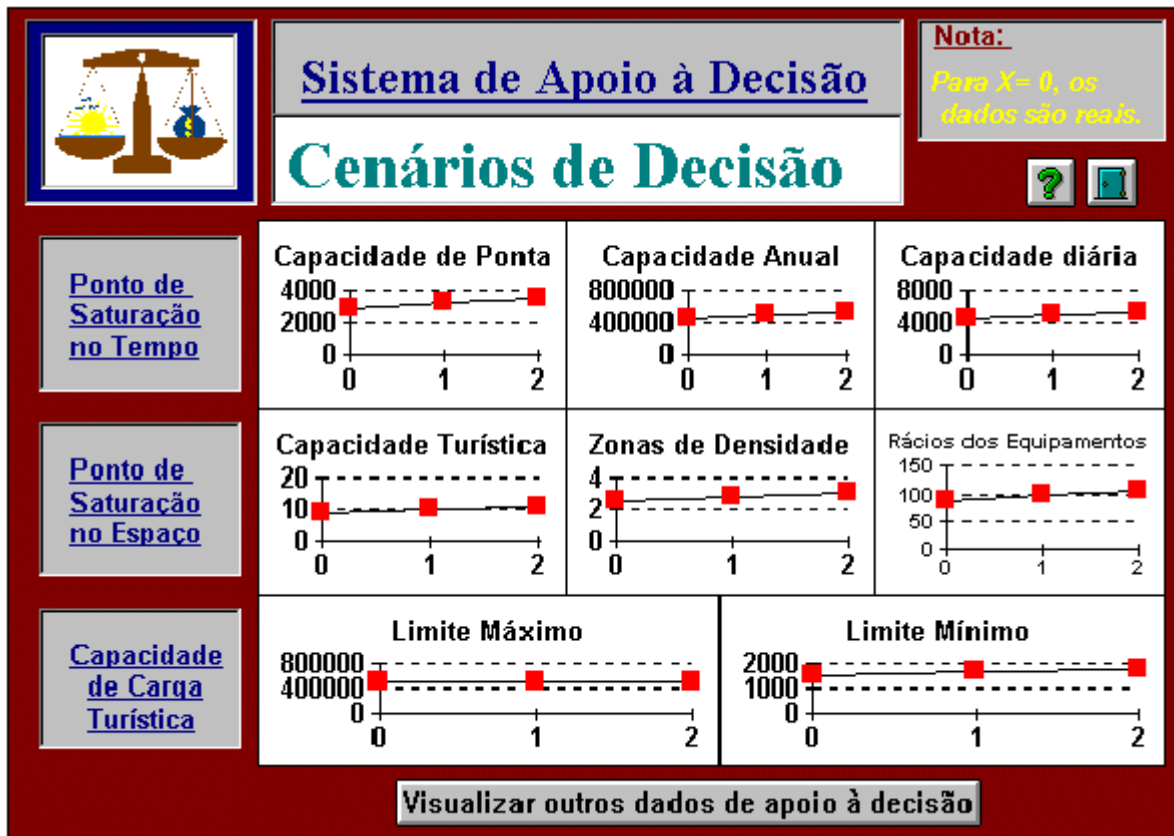
Figure 6 – Consult of the decision schemes